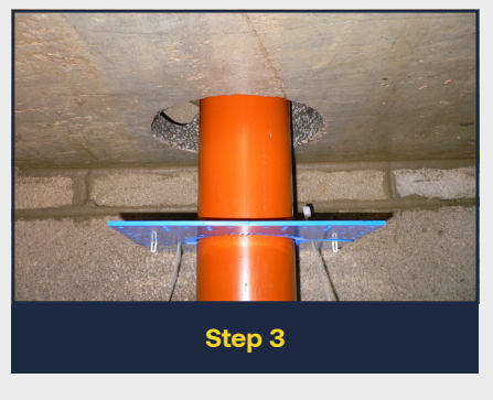
3 - Insert cable ties and push into position