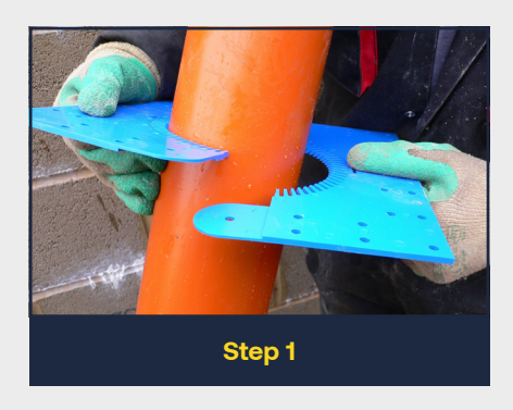
1 - Attach the Instant Pipe Shutter to the pipe