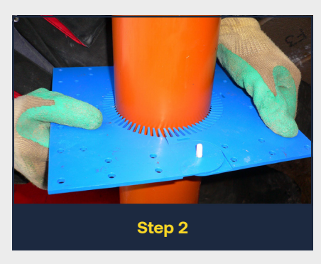
2 - Secure together with bolt and wing nut