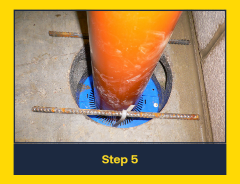
5 - Pull up the cable ties and secure into place