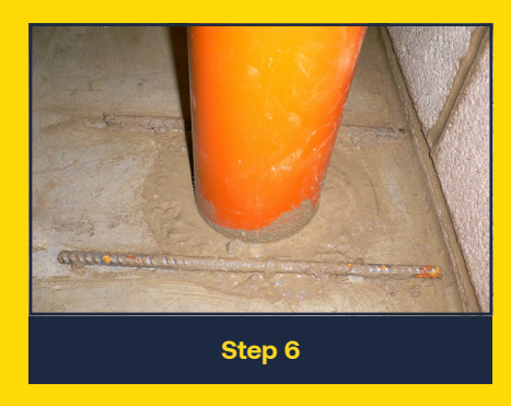
6 - Fill area with concrete and remove bars when set