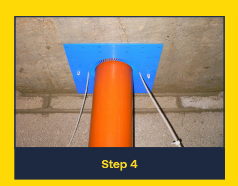
4 - Instant Pipe Shutter is now in position